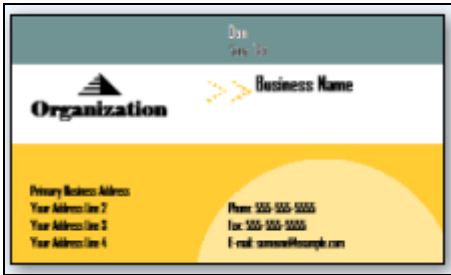
This is a business card