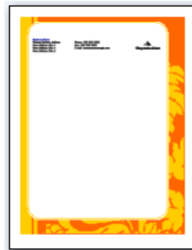
This is a letterhead