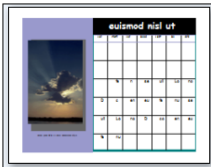
This is a calendar