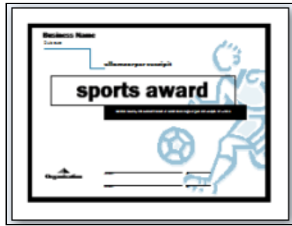
This is a certificate